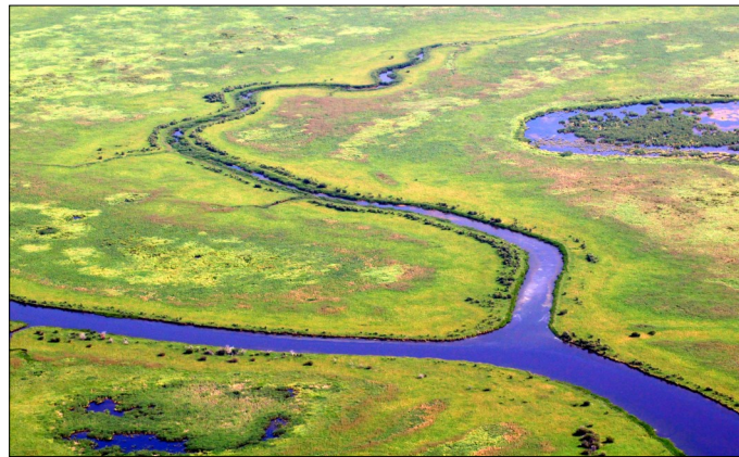
The Peace-Athabasca Delta.

The SEA provides an opportunity to get independent,