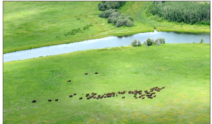
Bison in the Peace-Athabasca Delta in WBNP.

WBNP has these specific qualities that make the park im-