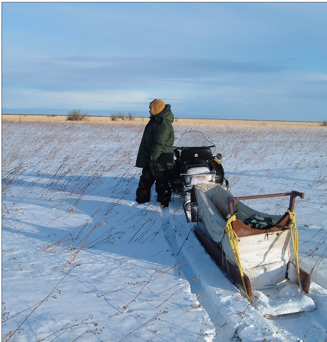
Traditional land use in the Peace-Athabasca Delta.

The SEA provides an opportunity to bring together traditional use studies and Indigenous perspectives that have been developed for other initiatives. The SEA will make use of existing reports and publications and will not involve new studies. Parks Canada and the consultant