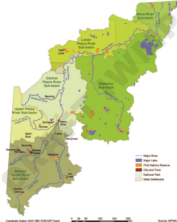
Peace and Slave Watersheds

A comparison could be made to a house where the IWMP is the framing and provides a skeleton or structure on which to arrange and organize other work. Initiatives that address certain 'Issues of Concern' will be added to the framing and provide the siding and roofing.